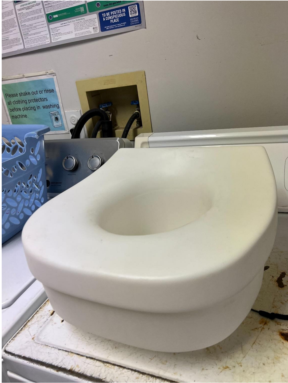
Raised toilet seat.