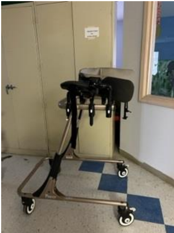
Pacer Standing Walker