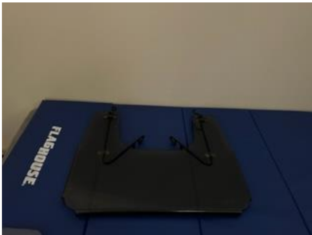
Various Tray Tables to attach to wheelchairs.