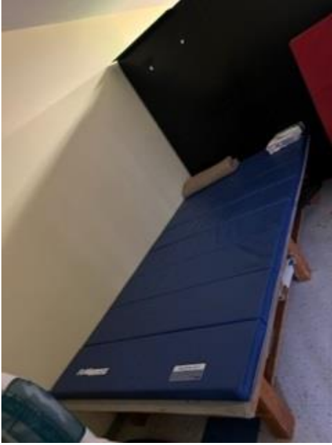
2 mat tables 1 lg 1 sm