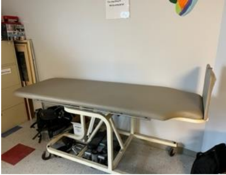
Manual Tilt Table